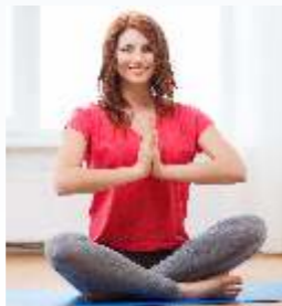
Yoga / Meditation